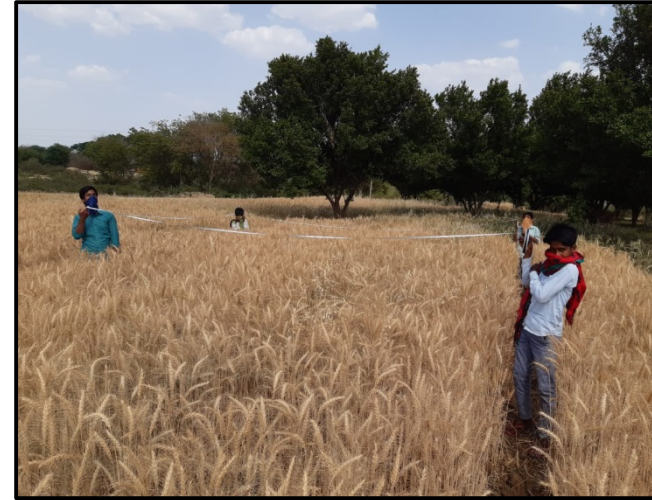
District: Ajmer, Tehsil: Bhinai