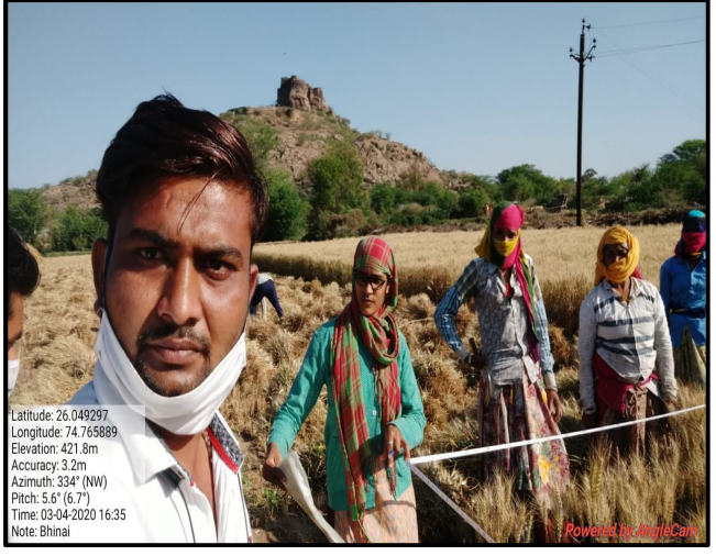
District: Ajmer, Tehsil: Bhinai