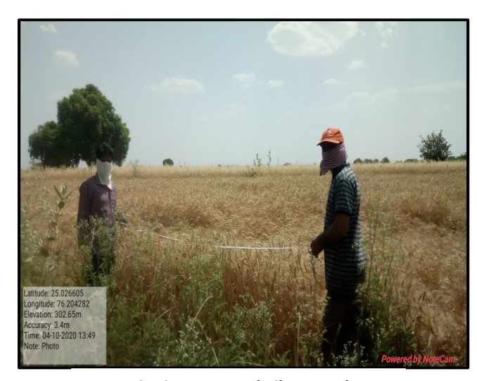
District: Kota ,Tehsil: Sangod