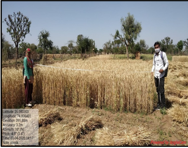
District:Ajmer, Tehsil: Bhinai