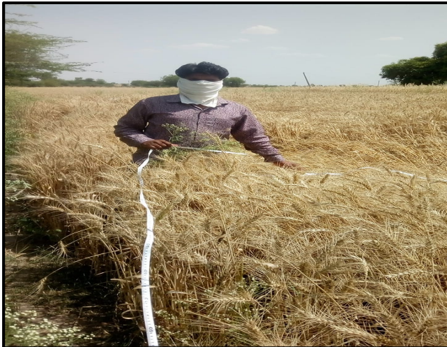
District: Kota ,Tehsil: Sangod