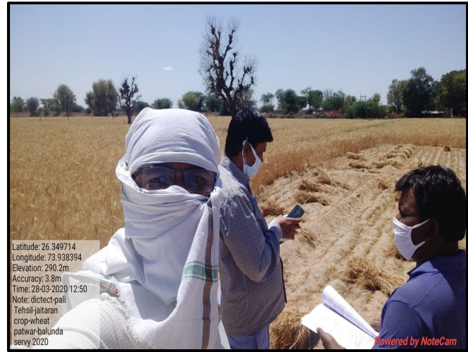
District:Pali ,Tehsil: Jaitaran