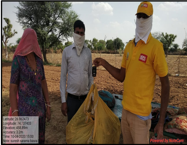
District:Nagaur ,Tehsil: Parbatsar