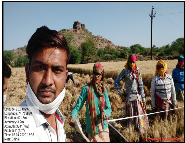
District: Ajmer, Tehsil: Bhinai

HDFC ERGO General Insurance Company Limited. IRDAI Reg. No.146. CIN: U66030MH2007PLC177117. Registered & Corporate Office: 1st Floor, HDFC House, 165-166 Backbay Reclamation, H. T. Parekh Marg, Churchgate, Mumbai – 400 020. For more details on the risk factors, terms and conditions, please read the sales brochure/ prospectus before concluding the sale. Trade Logo displayed above belongs to HDFC Ltd and ERGO International AG and used by the Company under license. UIN: CSC - Pradhan Mantri Fasal Bima Yojana - HDE-AG-P18-25-V01-17-18, Pradhan Mantri Fasal Bima Yojana- IRDAN125P0003V01201617 UID-XXXX