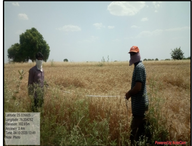
District: Kota ,Tehsil: Sangod