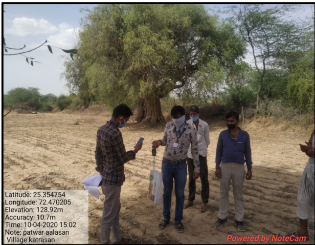
District: Jalore, Tehsil: Jalore