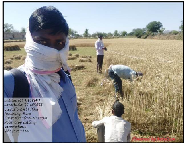
District: Sikar, Tehsil: Neem ka Thana