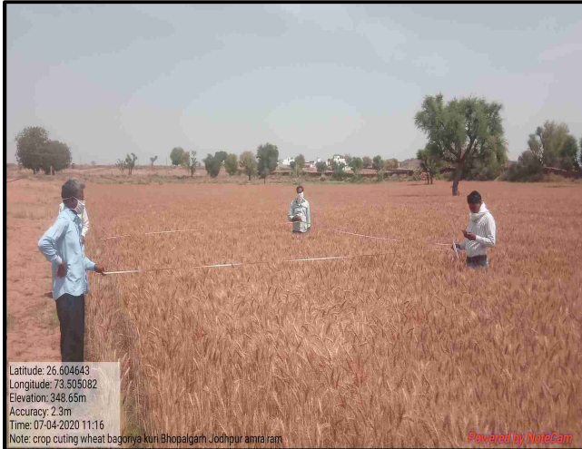
District: Jodhpur , Tehsil: Bhopalgrdh