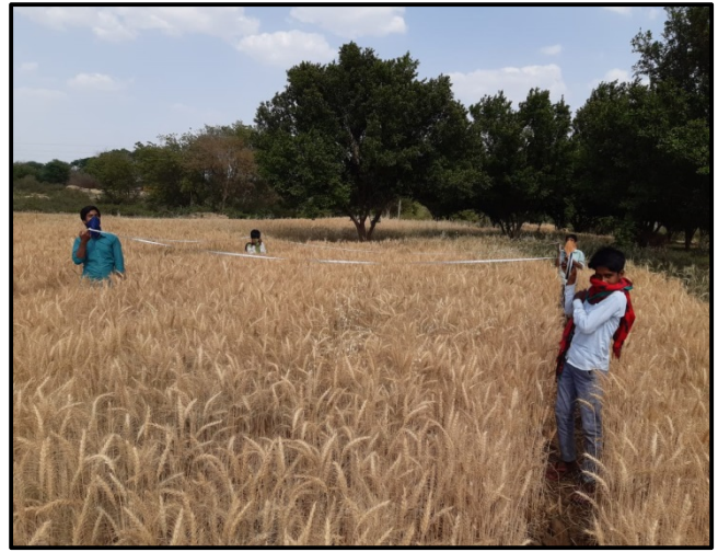
District:Jhalawar, Tehsil: Pachpahar