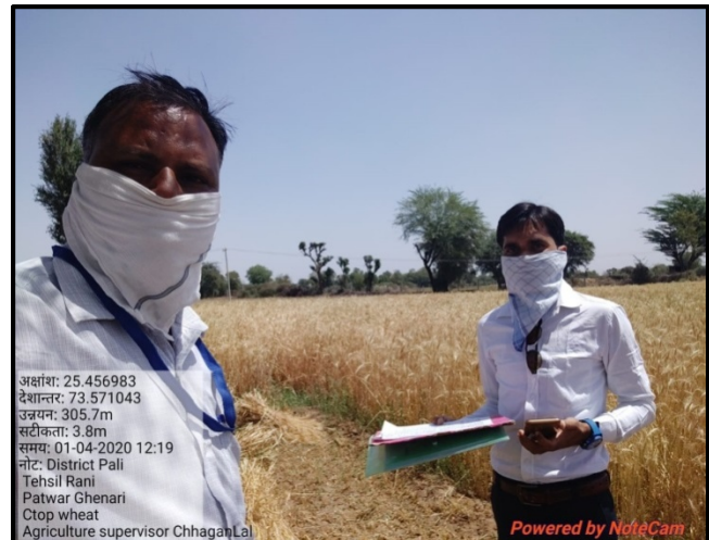
District:Pali ,Tehsil: Rani