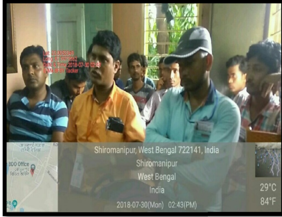
3. Gram Panchayat level Farmers meeting