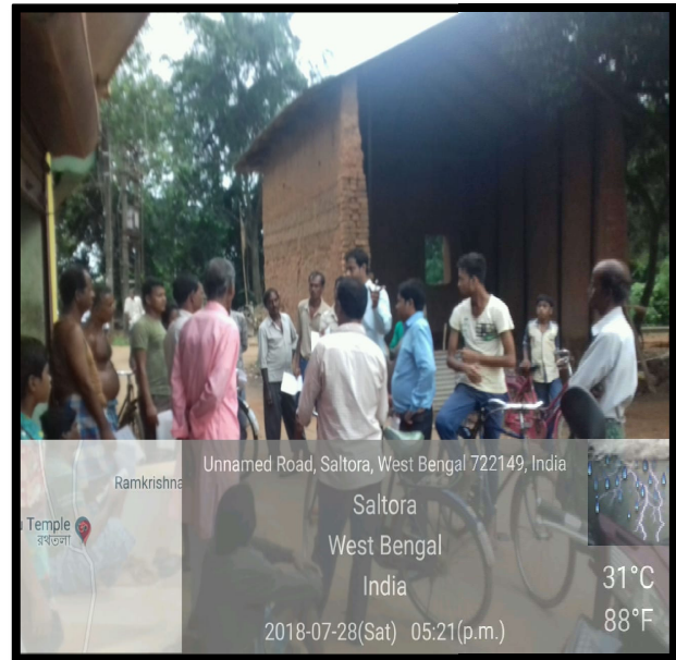
6. Leaflet Distribution in village