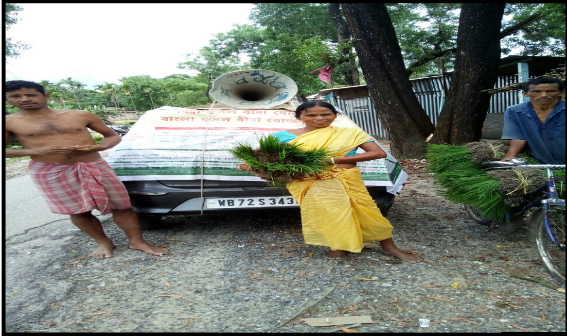
7. Van Campaign