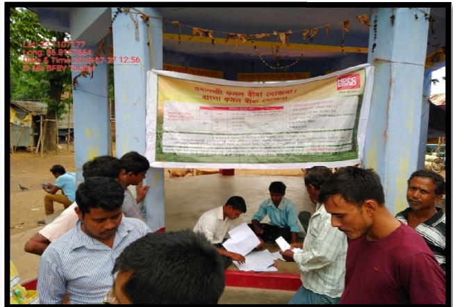
4. Village level Non-Loanee Form fill up activity